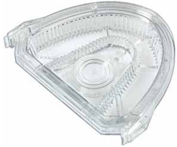
tray transparent / rim and lock transparent