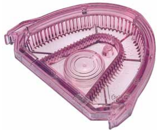
tray violet / rim and lock violet