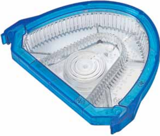
tray transparent / rim and lock transparent-blue