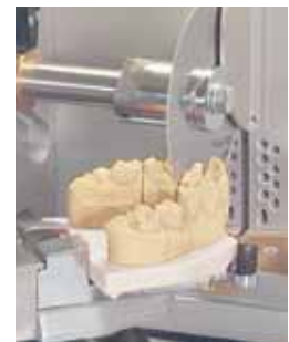
pin model on plastic base