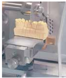
model-tray quarter model