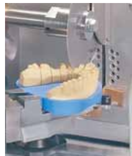
pin model on plaster base