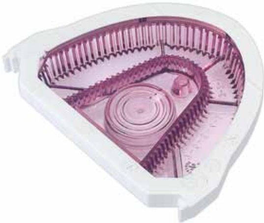
tray violet / rim and lock white